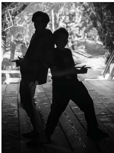
03 - Brothers.jpg