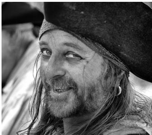
01 - A Pirate's Life For Me.jpg