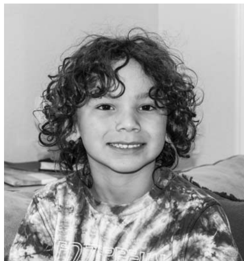
02 - Birthday Boy.jpg